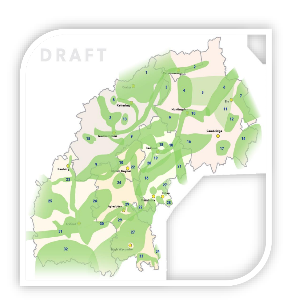
Example Opportunity map

Supports strategic decision making and opportunities to connect habitats and benefits